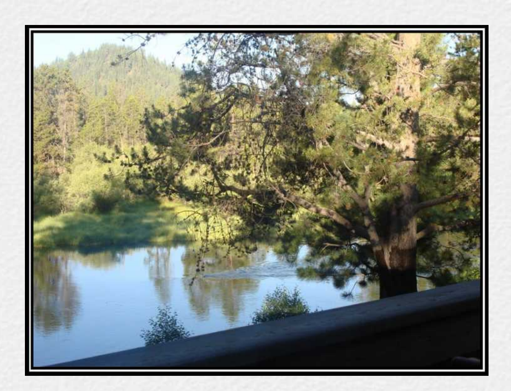
With much love, Ram and Sundari