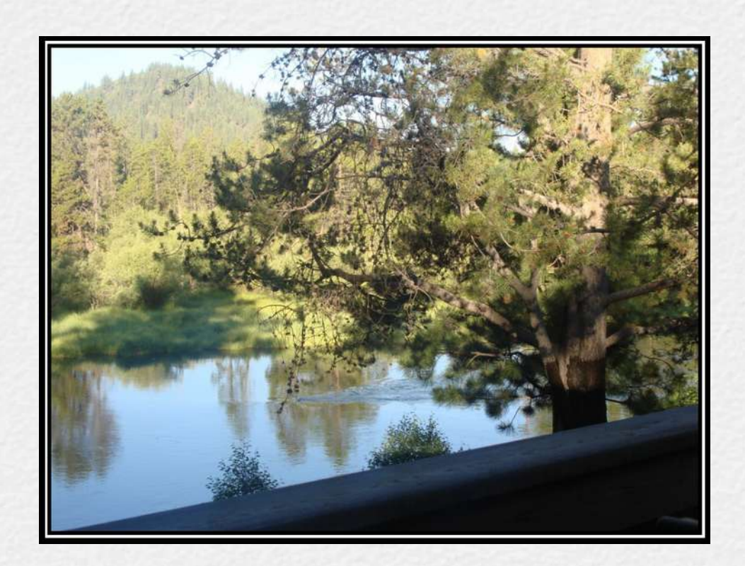
With much love, Ram and Sundari